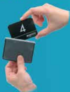
Plate Barrier Envelope

Made with environmentally friendly materials which avoid cross contamination and provide protection for the patient.