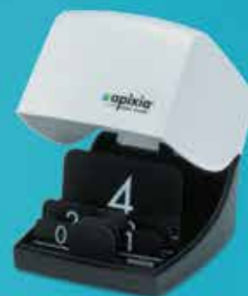
Plate Transfer Box

Provides protection, easy storage and transportation of phosphor plates.