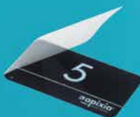
Plastic Plate Carrier

Made with environmentally friendly materials which avoid cross contamination and provide protection for the patient.