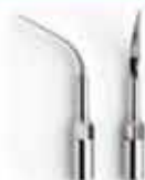
88004 Universal B